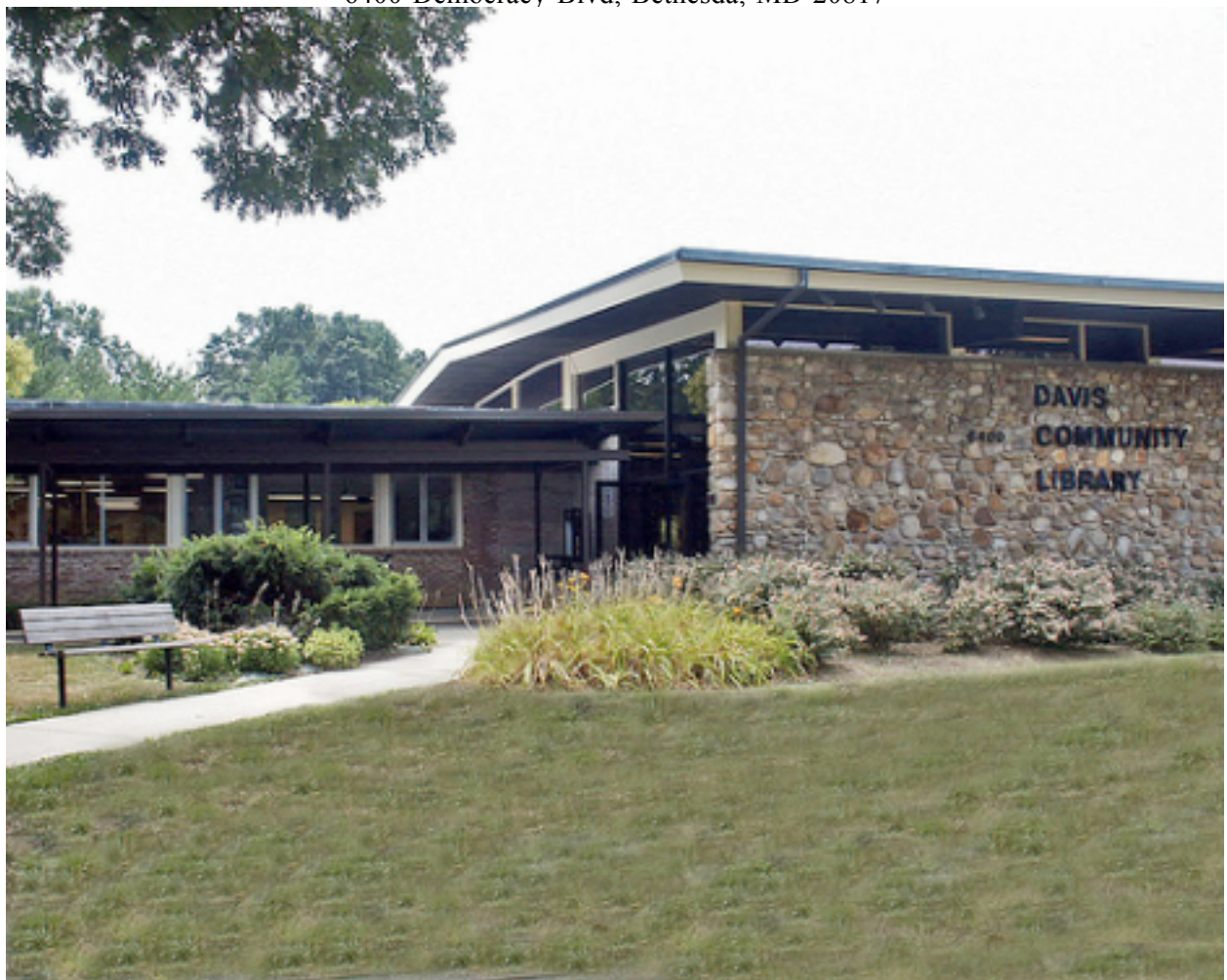
DAVIS LIBRARY 6400 Democracy Blvd, Bethesda, MD 20817

About the Library: The Davis Library in North Bethesda is separated from the busy traffic of Democracy Boulevard by a sweeping expanse of lawn, all that is left of the Davis family farm. Montgomery County acquired the farmland and built the 16,000 square foot library in 1964. The architecture is classic for the period with a fieldstone exterior evoking the rural heritage of the property. The entry lobby features a bronze sculpture, "Taking Off" by Marcia Billig, which symbolizes the flight of imagination through reading.